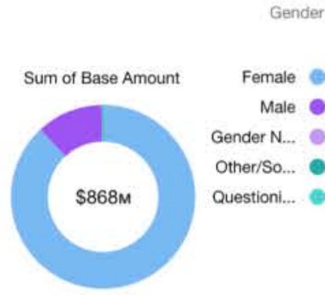
Approved Funding by Gender