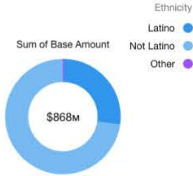
Approved Funding by Ethnicity