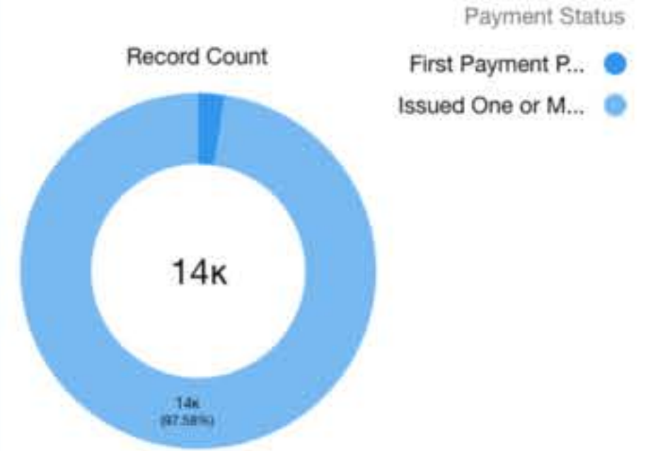
Approved by Payment Status